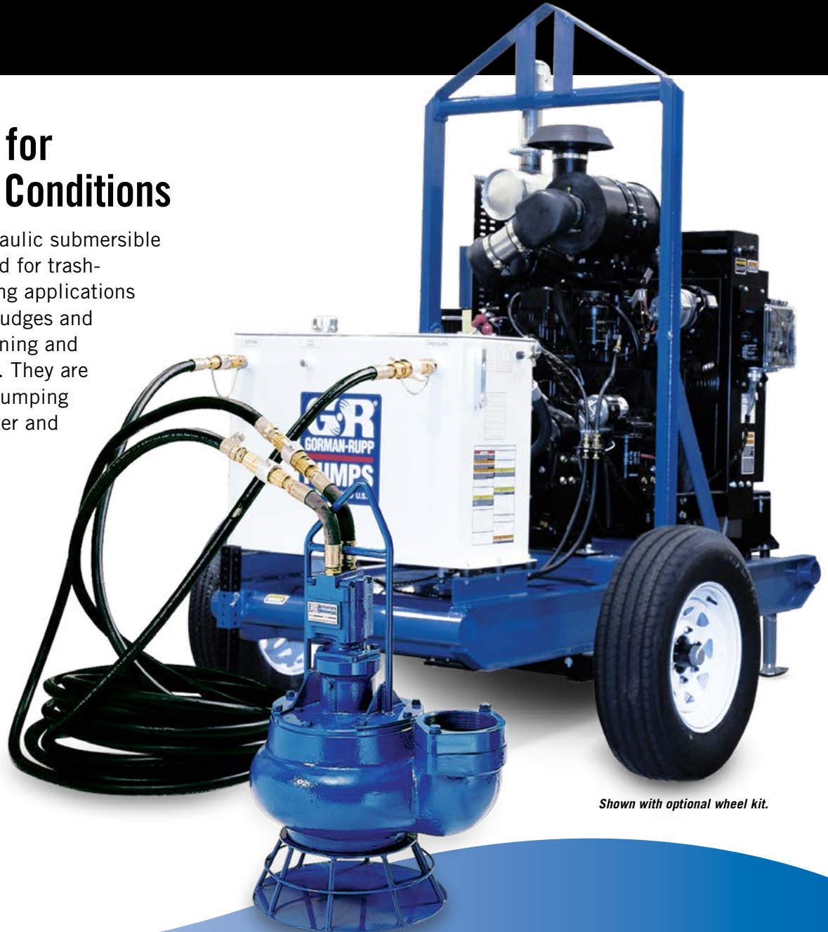
Shown with optional wheel kit.

Gorman-Rupp hydraulic submersible pumps are designed for trash-handling, dewatering applications and for pumping sludges and slurries such as mining and paper plant wastes. They are also excellent for pumping sewage from digester and holding tanks.