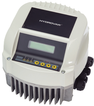
Pump Mounted Variable Speed Controller