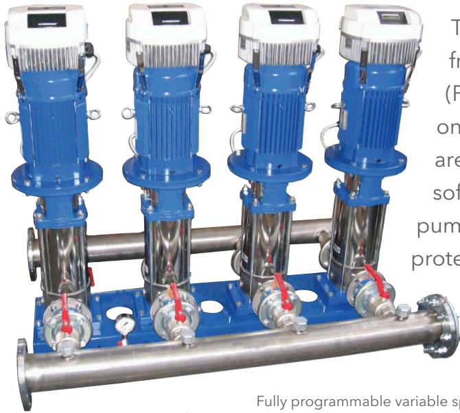
Fully programmable variable speed drives in space saving pump-mounted design

The Hydrovar controller is a combination of a variable frequency drive and a programmable logic controller (PLC) in one compact package, which can be mounted on the fan cover of a TEFC pump motor. Drives are pre-programmed with patented pump specific software, designed for centrifugal pumps. They match pump output to a wide range of system conditions while protecting the pump, the motor and the pumping system.