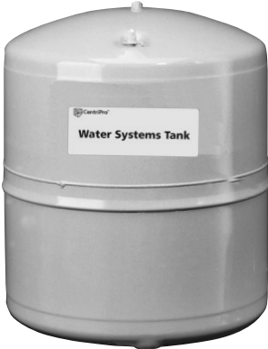
In-Line Pipe Mounted Model