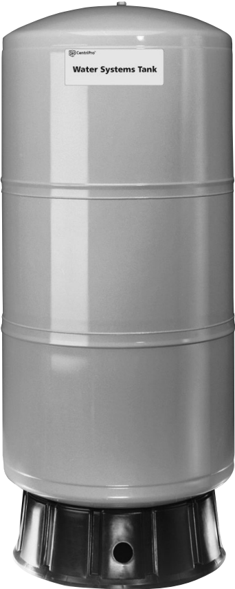
Stand Model (Vertical)