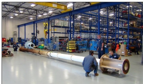
MACHINING AND PUMP REPAIR