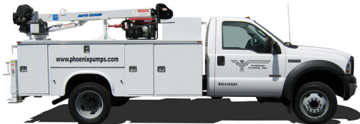
AZ Contractors License #ROC245283

ABS AESSEAL AIR PUMP COMPANY AMERICAN-MARSH ARO BALDOR BLACKMER BLACOH CAT PUMPS CHEMPUMP CORKEN CORNELL DEAN EBARA EMERSONJUS ENSIVAL FILTER SPECIALISTS FLOWAY FLUX FYBROC GORMAN RUPP GOULD S&L GRI GRISWOLD GRUNDFOS ALLDOS GUSHER HYDRA-CELL HYDROMATIC IWAKI LIQUID CONTROLS LOBEPRO MARCH MASTER PNEUMATICS MONIFLO MTH POWER PRIME PRICE PUMP SETHCO STENNER THERMO SCIENTIFIC VERSAMATIC VIKING WARREN RUPP WEG WEMCO WILDEN WILFLEY YAMADA