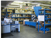
Large Local Inventory

Phoenix Pumps, Inc. offers field services ranging from repairs and retrofits to turn-key installations. Our field service technicians are committed to bring your system back up quickly. We know your time is limited, so let us help.