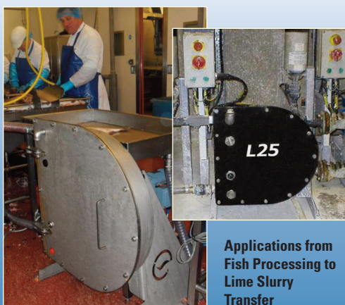
Applications from Fish Processing to Lime Slurry Transfer